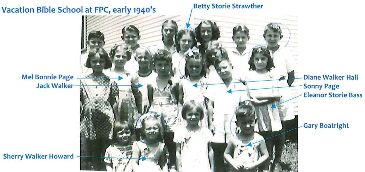
Vacation Bible School at FPC, early 1940's

Church family life in our church was so important to all our lives. It was great training for our families and for this church. I know it has produced many great Christians throughout the years.